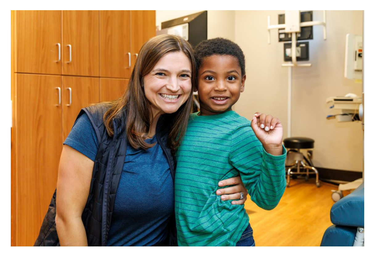
I did it!

After all of my pictures are done, my grown up and the speech language pathologist will talk for a few minutes.