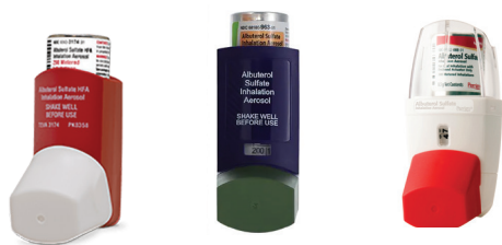
(Generic Albuterol Sulfate)