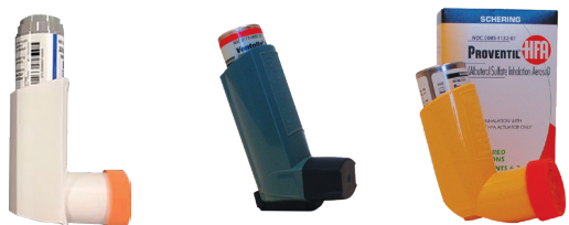
(Generic Albuterol Sulfate)