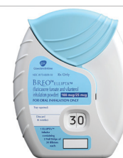
Breo Ellipta® (Fluticasone/Vilanterol)