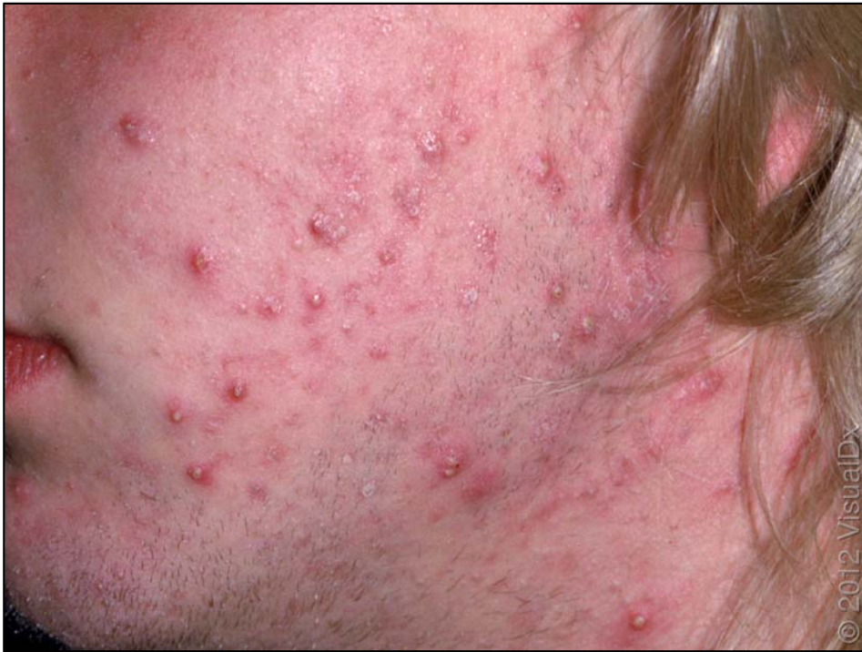
Papules and Pustules