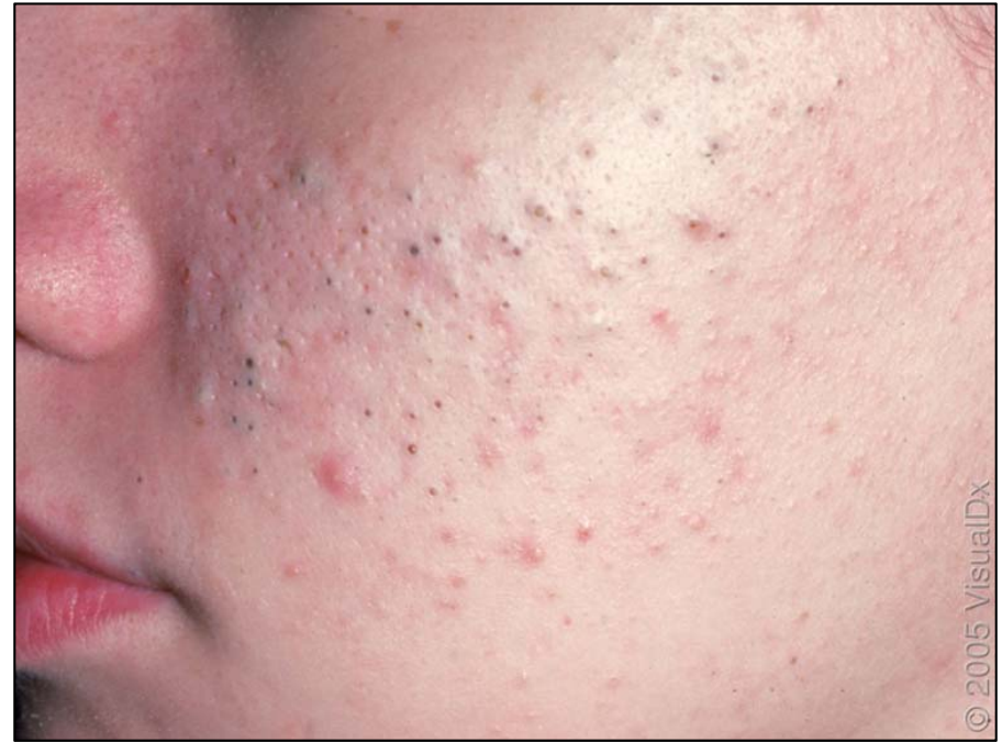
Open Comedones (blackheads)