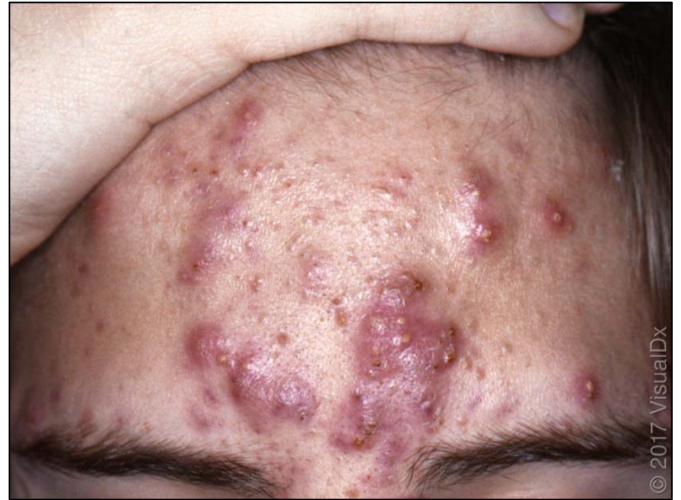
Nodules / Cysts