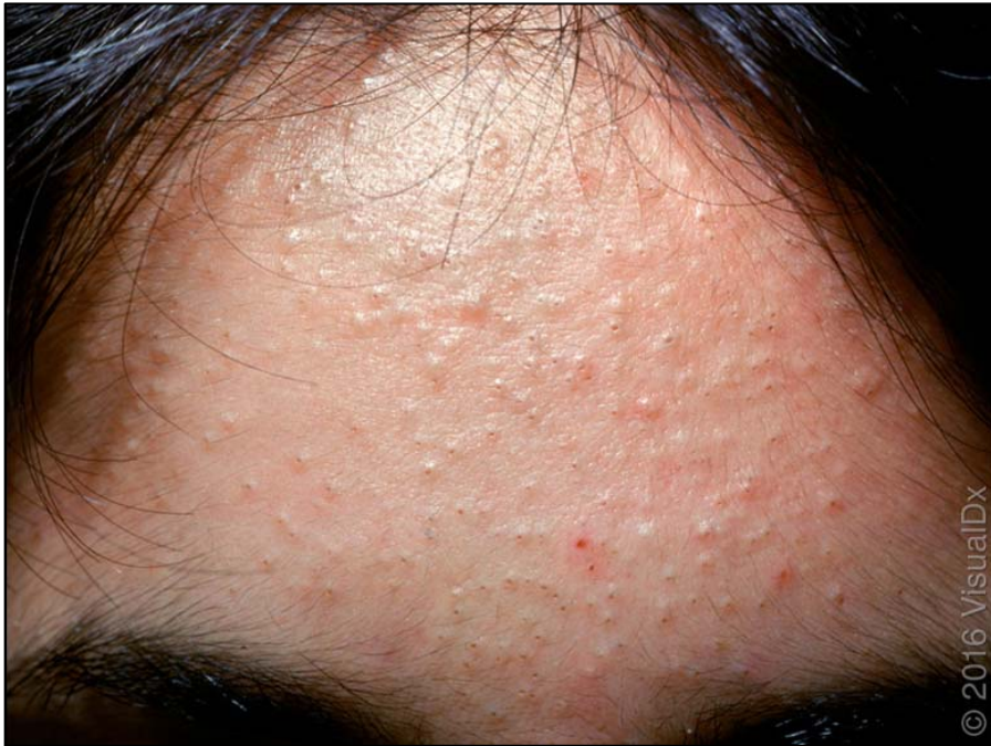
Closed Comedones (whiteheads)