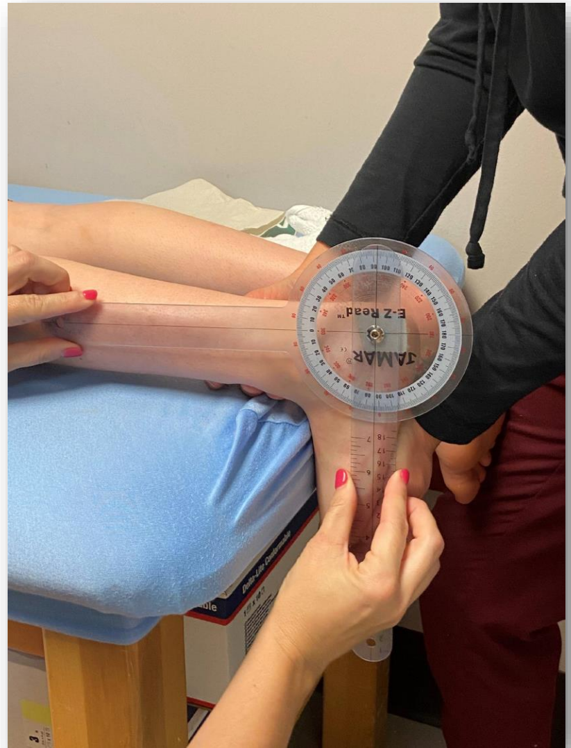
The Physical Therapist will measure with my leg bent and laying flat.